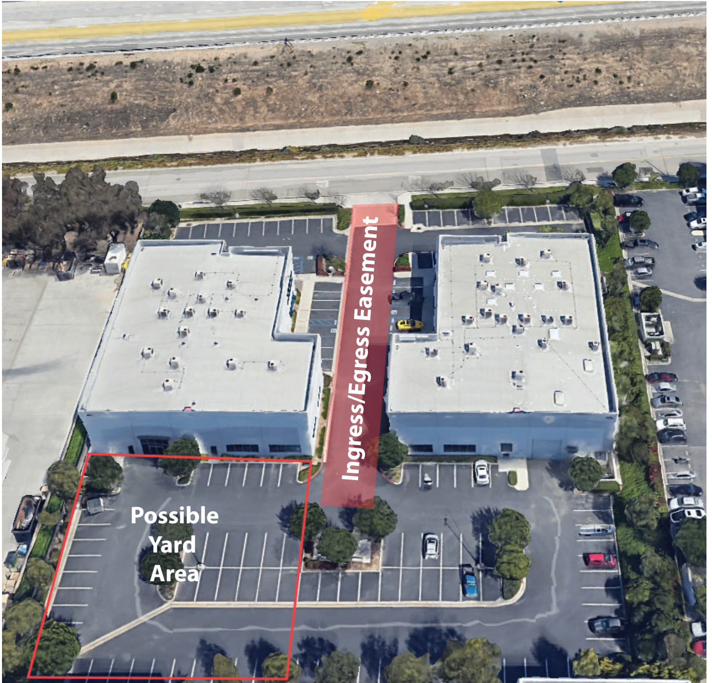
Possible Fenced Yard

Contact: Timothy Hawke | T (951) 280-1733